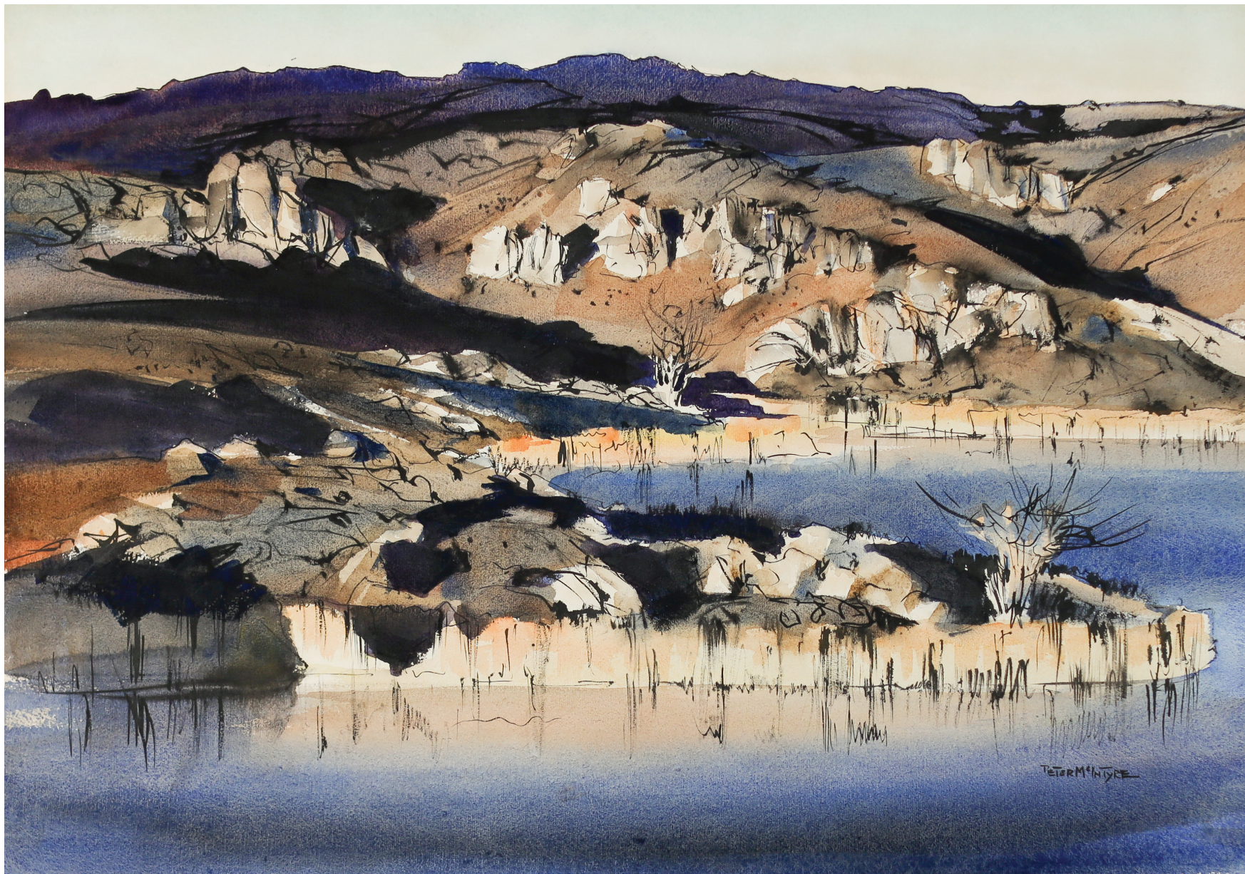
The Manorburn Dam, Central Otago Watercolour & ink on paper, 52 x 74 cm, signed lower right