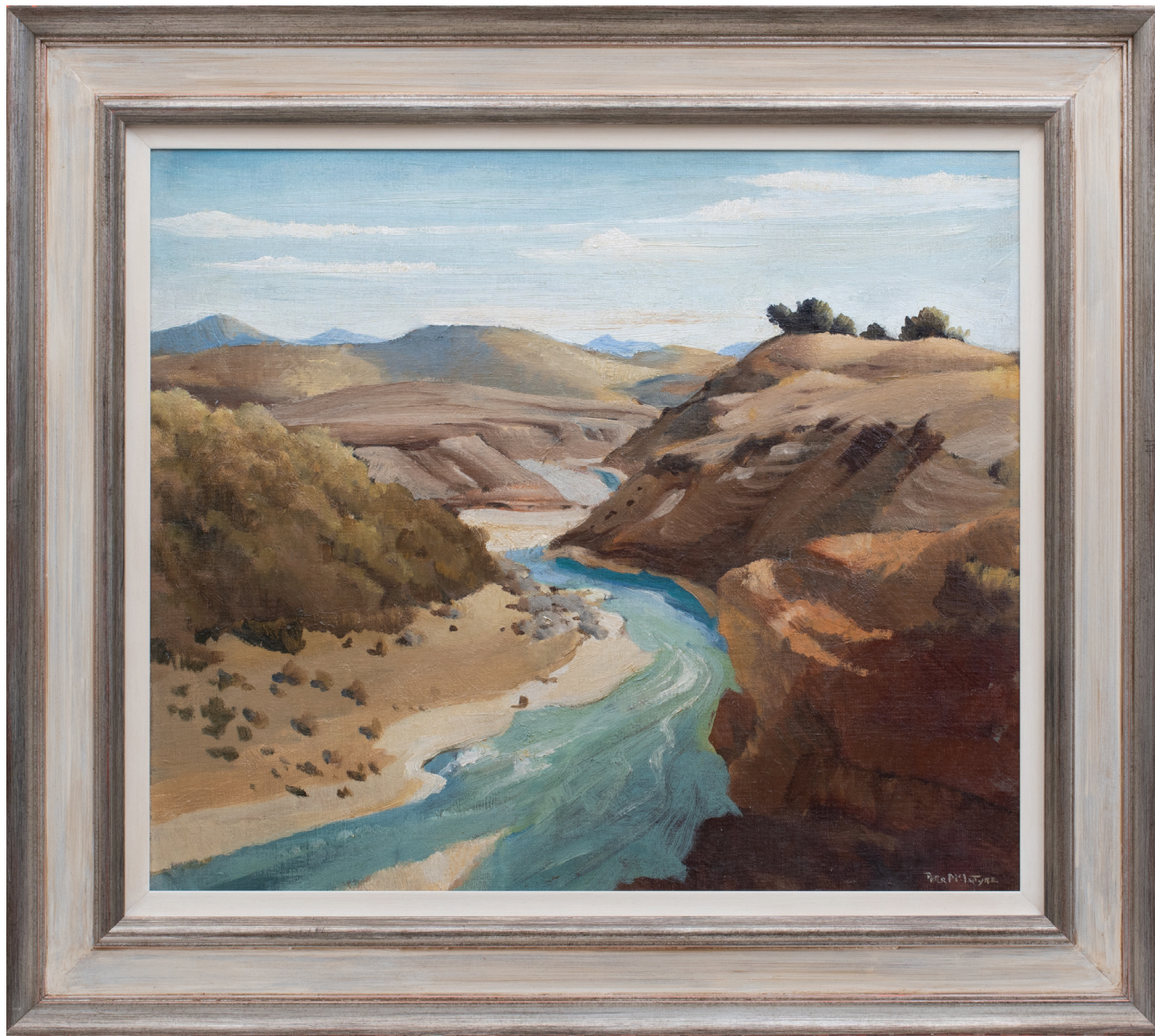
A Mountain Stream near the Desert Road Oil on board, 45 x 53 cm, signed lower right Inscribed & dated 1949 verso

"The Desert Road crosses a comparatively small area but it is one of those parts of New Zealand that has a face and presence all its own. Only a mile from the road I have watched the evening light while the trout rose on the small stream below me and a deer, head up and watchful, came out of the beech forest to drink at a pool". - Peter McIntyre's New Zealand, 1964