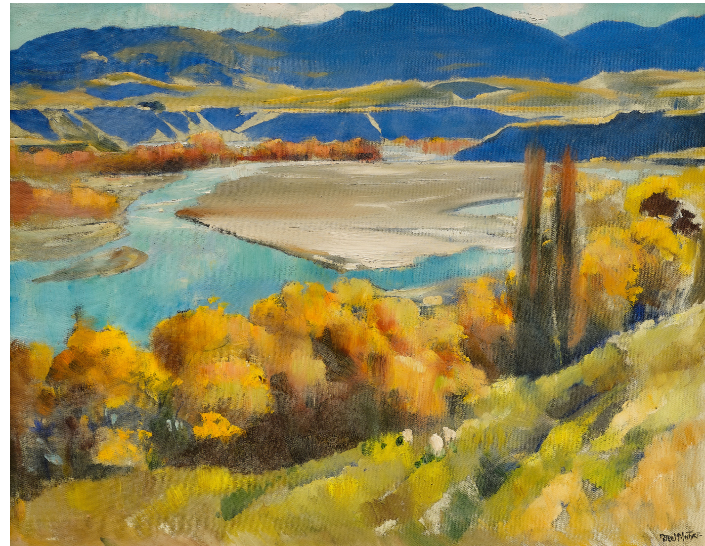
The Awatere, Marlborough Oil on board, 76 x 60 cm Illustrated: Peter McIntyre's New Zealand, Plate 37

"The River valley in this scene has the lowest rainfall in New Zealand but that doesn't stop the frost. We had parked our caravan across the river and awoke in the morning to fields of white. Here, in a promise of warmth, the early morning sun begins to light the cliffs in a golden glow."