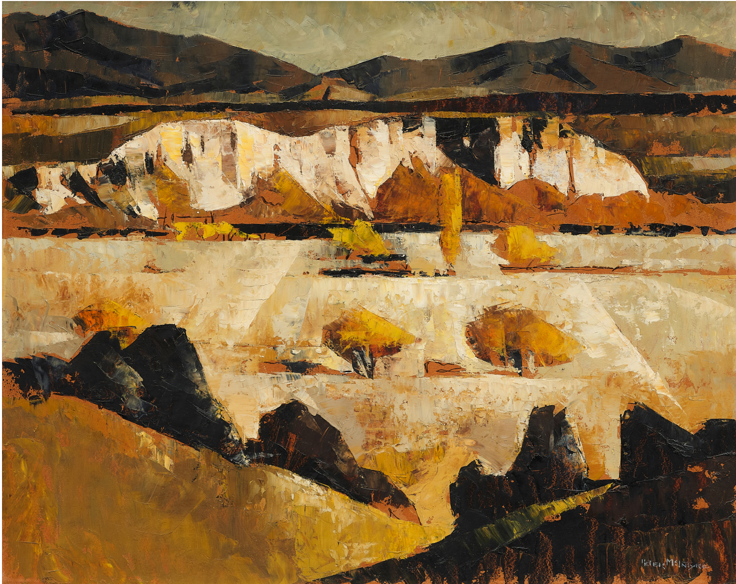
Frosty Morning, Galloway Oil on board, 60 x 75.5 cm

"The wind was cutting like a razor across the tussocks and there was no sign of life. The snow on the distant ranges peeped over the top of the roofs and I simply had to paint for it was the very essence of the old Central Otago."