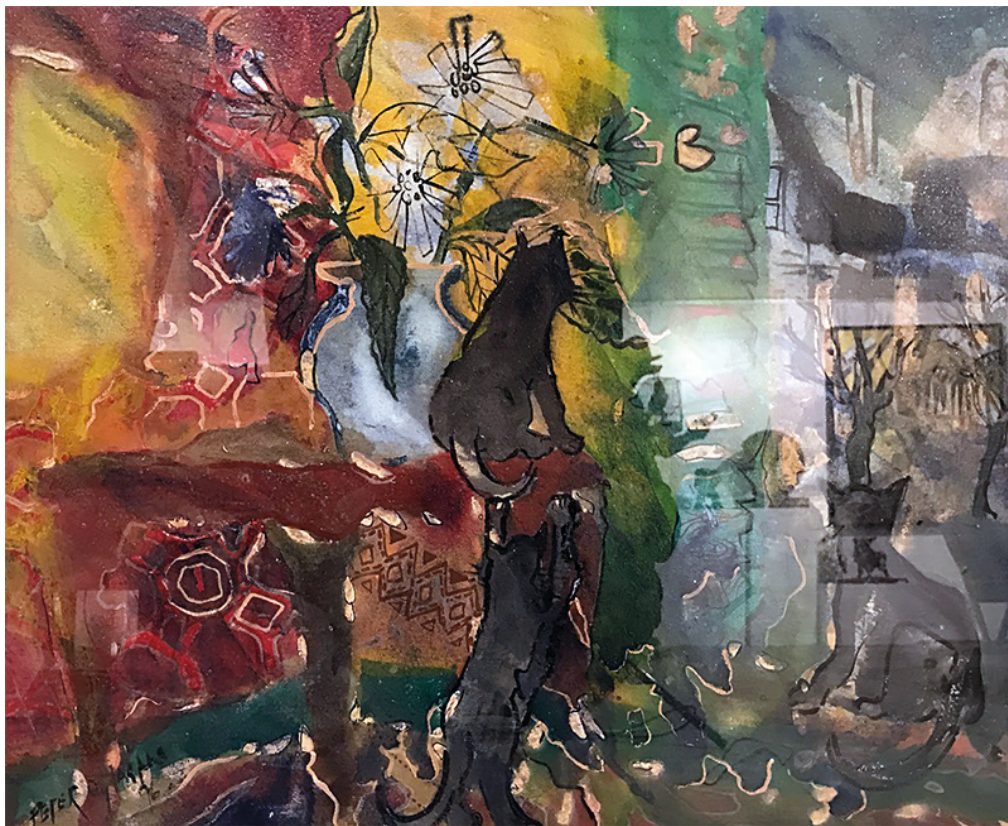
Three Cats in Brooklyn Watercolour & Gouache, 53 x 64 cm