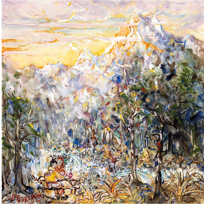
The wives sip Champagne at the Hotel Hermitage while the husbands fish for rainbow trout beneath the majesty of New Zealand's highest mountain. Mt Cook Aoraki Watercolour & gouache, 61 x 61 cm