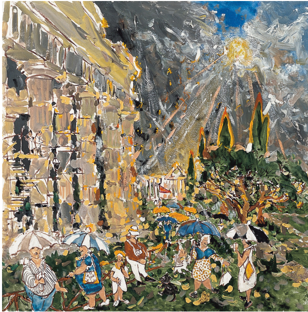
More Tourists: Paestum, Near Naples Watercolour, 60 x 60 cm