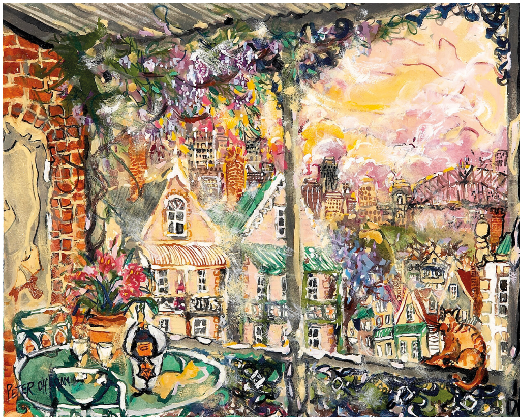
View from the balcony, Potts Point Sydney Watercolour, 41 x 51 cm