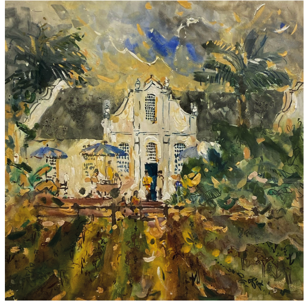
400 Years of Winemaking - Neethlingshof Cape Town Watercolour, 54 x 56 cm