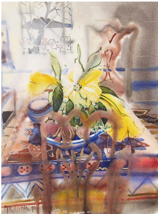
The Dining Room, Highwic Acrylic on canvas, 75 x 54 cm