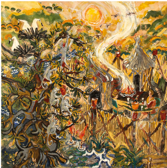
Every Day at the Boma Watercolour, gouache & tinted gum arabic, 76 x 76 cm