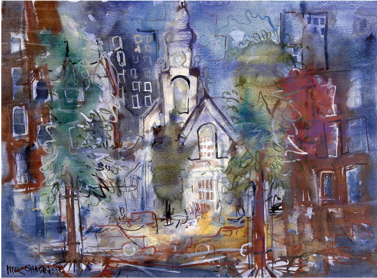
New York, 87 th East Side of Madison Watercolour, 55 x 74 cm