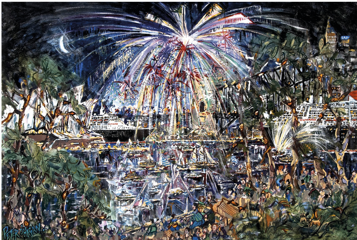
A Waterfront Celebration Second to None - QE2 & Queen Mary 2, Sydney Watercolour & gouache, 61 x 91 cm