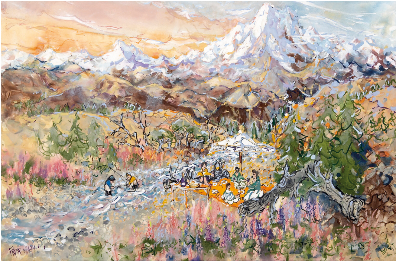
A Very Suitable Pinot to Have Amongst the Wild Lupins of Central Otago - A View of Mount Cook Watercolour & gouache, 61 x 92 cm