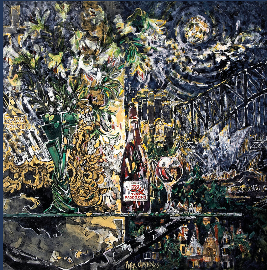
Celebration of a Burgundy Tradition Watercolour, gouache & tinted gum arabic, 102 x 102 cm