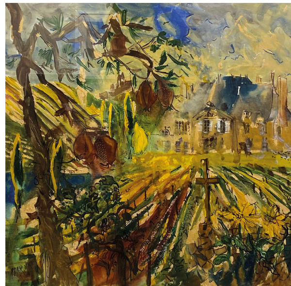
The last summer for the Pomegranate tree - Burgandy Gouache, 76 x 78 cm