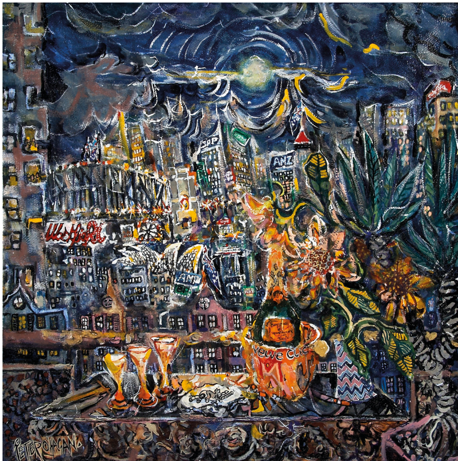
A View Enjoyed by the Many Residents of Darlinghurst Watercolour, gouache & tinted gum arabic, 76 x 76 cm