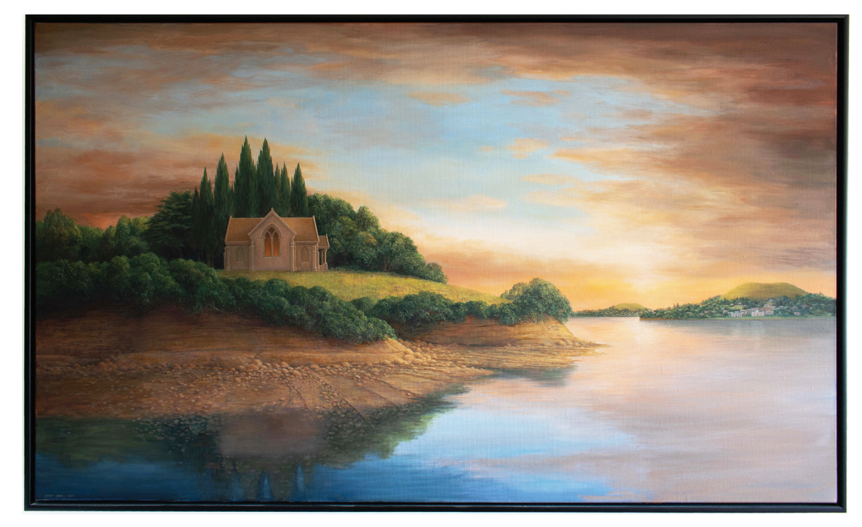
Evensong 2, Oil on canvas, 90 x 149 cm