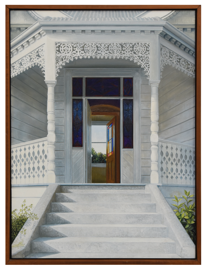
82 Clonbern Road, oil on board, 60.4 x 45 cm